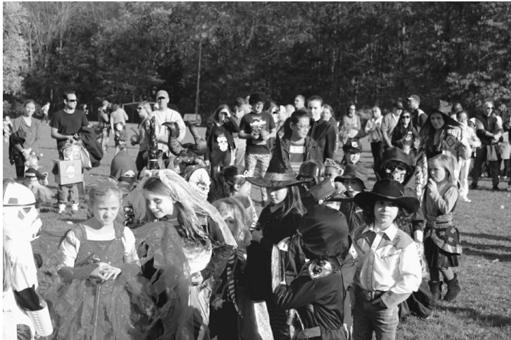
Our 2016 Halloween Parade.

The fall season brings many fall sports to Kantor Park, including field hockey (grades 5-8) and local soccer programs through the Watchung Hills Soccer Association (WHSA). Tennis programs through Skyline Tennis will continue at Kantor Park through the fall. Also, make sure to join us for our Town Obstacle Course this fall, where residents will compete for the coveted title.