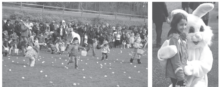
2016 Annual Egg Hunt at Kantor Park