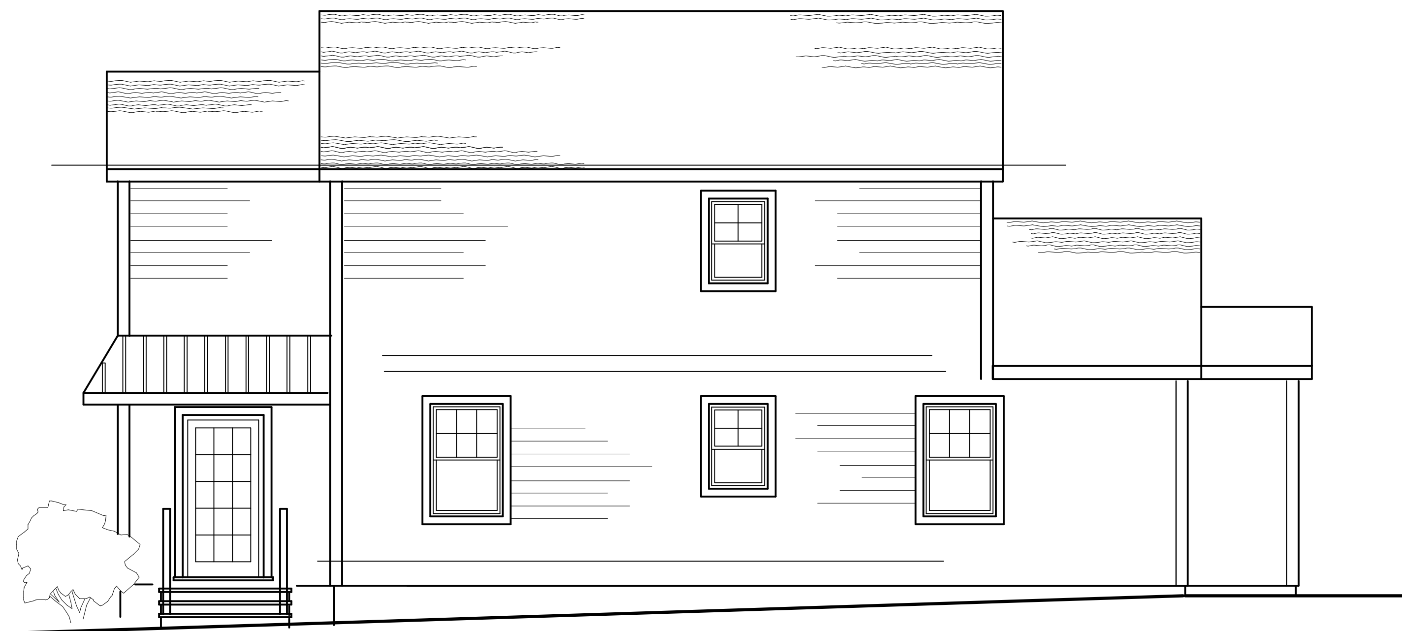
CONCEPTUAL RIGHT SIDE ELEVATION