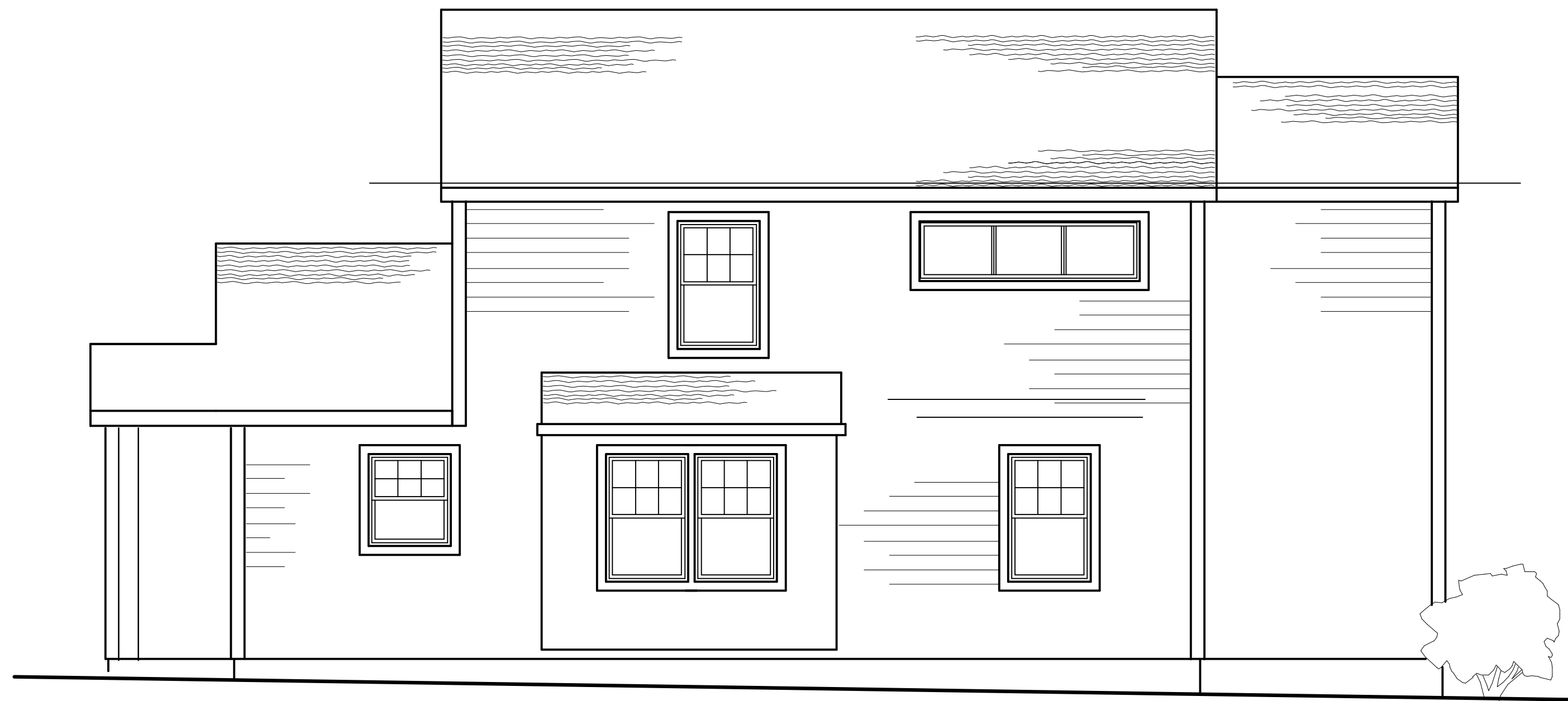
CONCEPTUAL LEFTSIDE ELEVATION