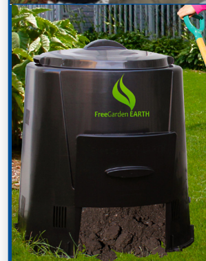
FreeGarden ™ EARTH Compost Bin $65