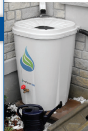
FreeGarden RAIN ® 55 Gallon Rain Barrel $75