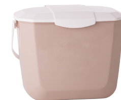
Kitchen Scrap Pail $12.00