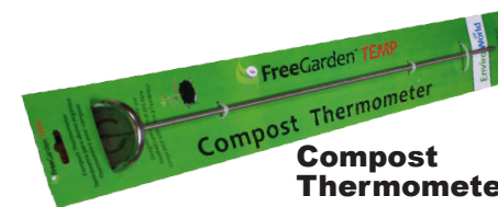
Compost Thermometer $20.00