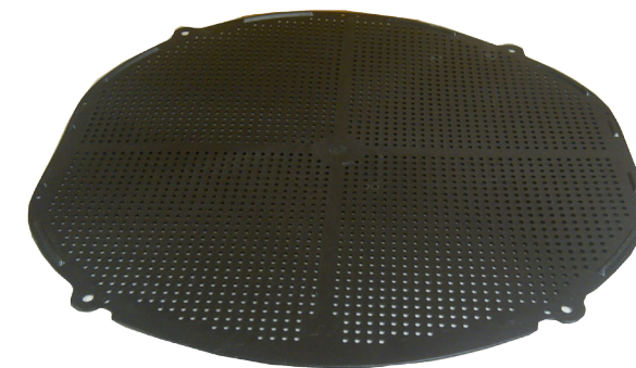
Compost Bin Mesh Bottom $15.00